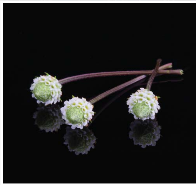
Dushi Button ( Verbena )

The plant is known in Europe for centuries already, thanks to the Spanish researcher who immediately recognized it as a great sweetener. The flower contains a little camphor and is not suitable to concentrating. Therefore you will not find this plant as a sugar substitute, only in its natural form. We have chosen the name Dushi (honey), to express the South-American character of the plant.