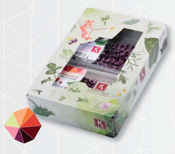
Content: 100 blossoms per tray

The optimum temperature for maintaining the best quality is between 2° and 4° C. Produced in a socially responsible culture, Zallotti Blossom meets the hygienic kitchen standards. The product is ready to use, since it is grown clean and hygienically.